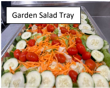
Garden Salad Tray